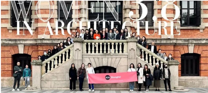
March 8 | Women in Architecture: Suzhou Creek Walking Tour

In celebrating the International Women's Day, our chapter held a special project tour along the Suzhou Creek for all our inspirational women in our design community. We are honored to have the developer, architect, urban, and landscape designers join us to discuss the fascinating events that led to the canal's transformation of the urban neighborhood over the last 13 years and the ongoing construction along the waterfront. We concluded the tour at the 'The Upper Room' rooftop bar. Special thanks to our sponsors CCAT and iGuzzini for supporting this event.