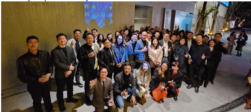
February 16 | Greater Bay Area Mixer

We partnered with the ULI and RIBA to host our first Greater Bay Area Mixer. The event was held at the (O Power) Drunk N Jump in Shenzhen on February 16. This event was designed to allow architects and designers to forge connections with those working in the Greater Bay Area.